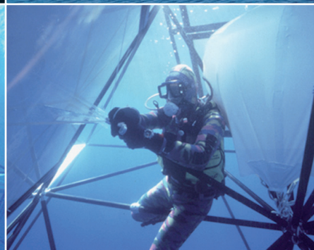
“Mare nel Mare” (The Sea in the Sea)