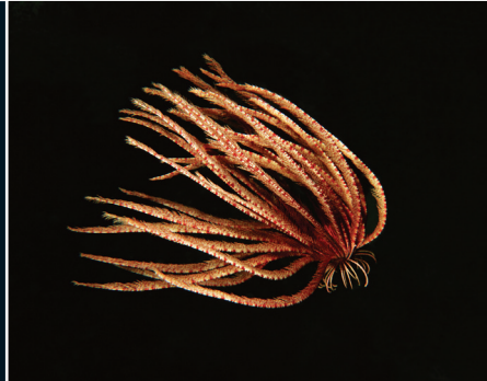
“Sapere di Mare” (Experience the sea)

The world of underwater photography discovers a new dimension, an explosion of colors, a new light captured so that dreams come true.